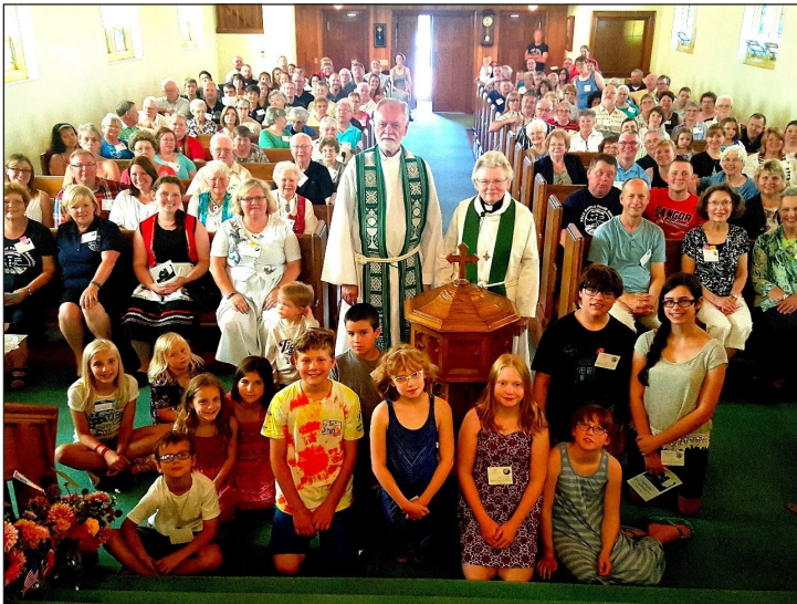
North Coon Prairie Lutheran Church in Newry, WI from the reunion.

There are 1759 women listed and 1922 men listed in the family tree including spouses for a total of 3681.